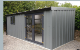
French Doors ANTHRACITE GREY