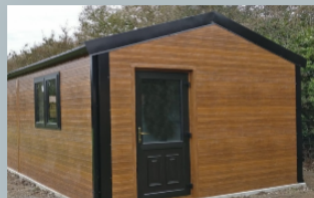
Half Glass Door BLACK