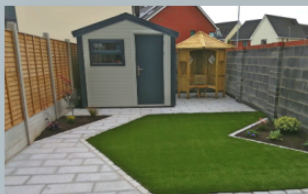
1020mm x 760mm Top Opening ANTHRACITE