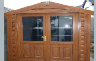
Half Glass French Doors GOLDEN OAK