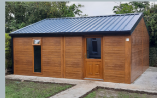
610mm x 1830mm Top Opening GOLDEN OAK