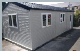
1350mm x 1070mm French Style WHITE