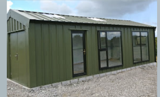
1830mm x 1830mm Side Opening BLACK