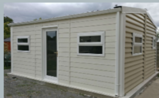
Full Glass Door WHITE