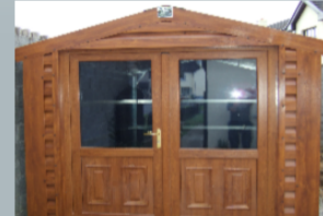
Half Glass French Doors GOLDEN OAK