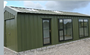
1830mm x 1830mm Side Opening BLACK