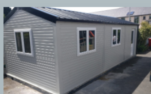
1350mm x 1070mm French Style WHITE